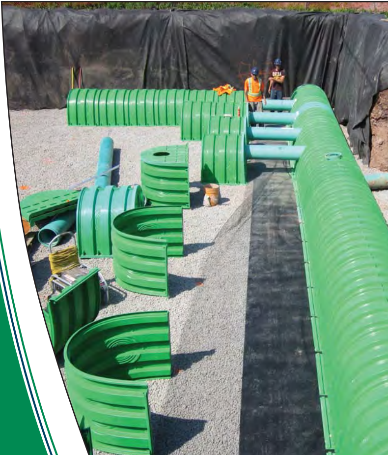
Plastic floor liner below the main header row and geogrid below the first two chambers of each distribution row