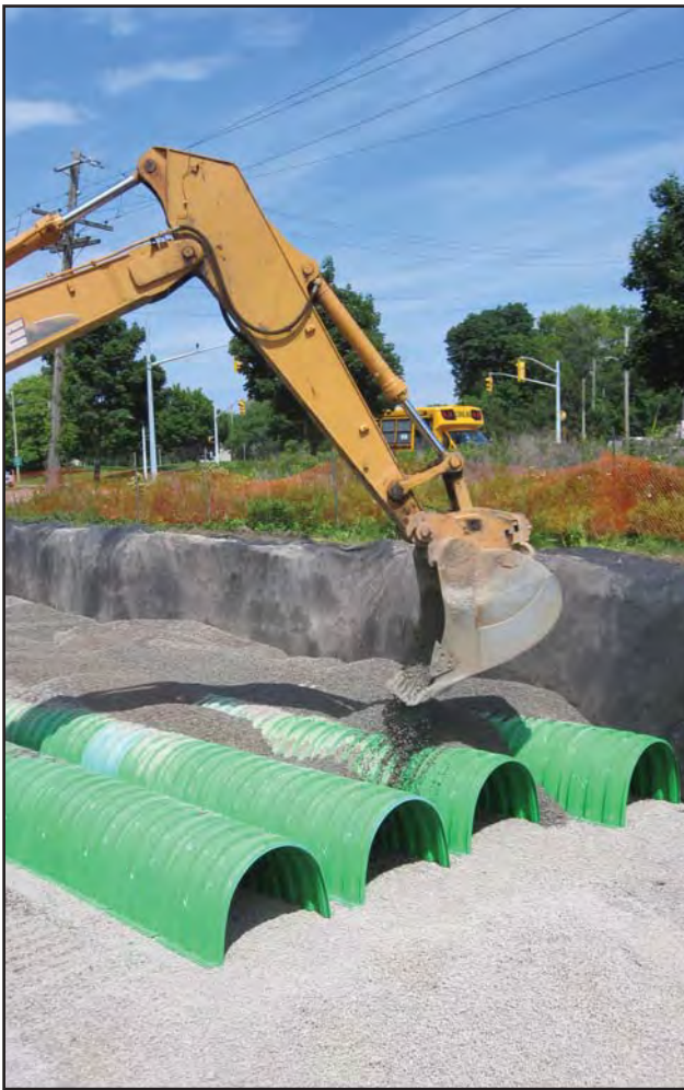
Surrounding the chambers with clear angular stone