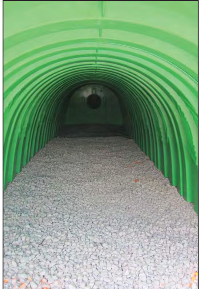
View inside distribution row