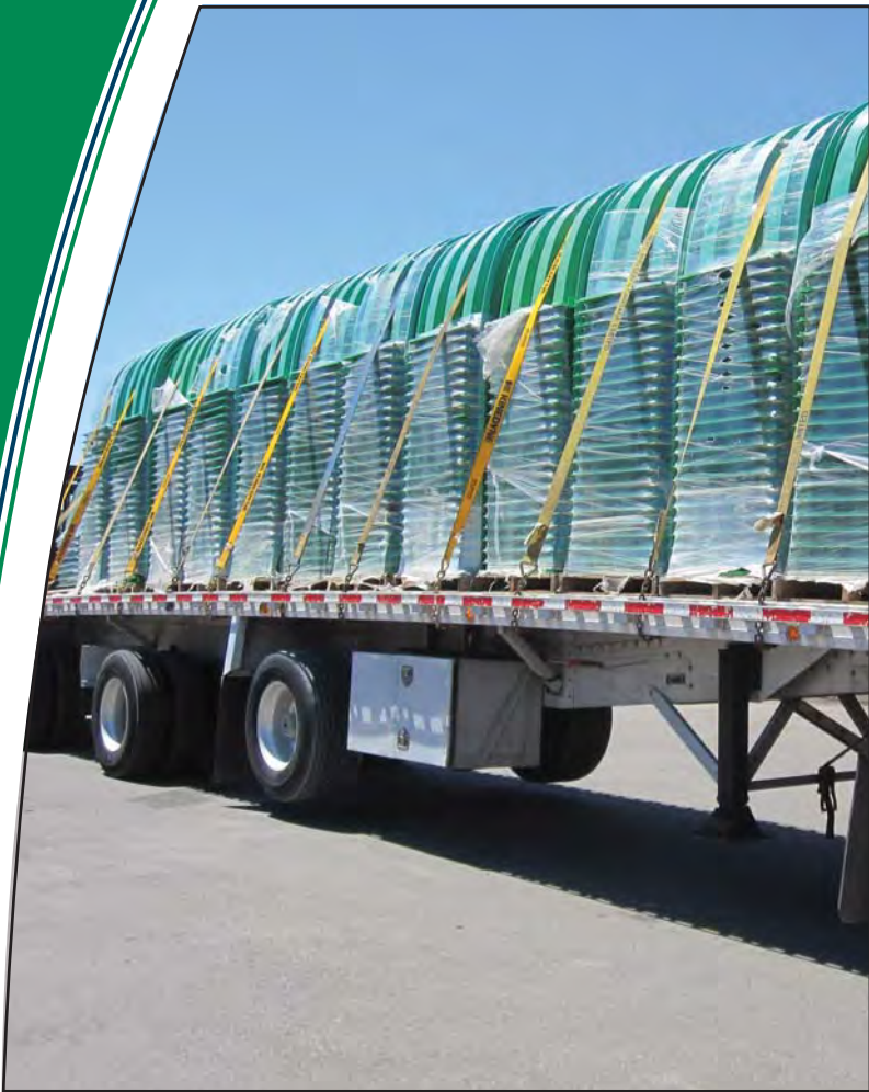
Delivery of chambers