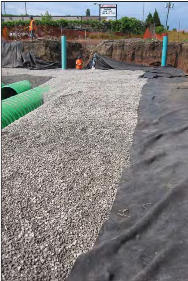
Minimum 150mm clear stone cover followed by geotextile to prevent fines of backfill material from entering the system