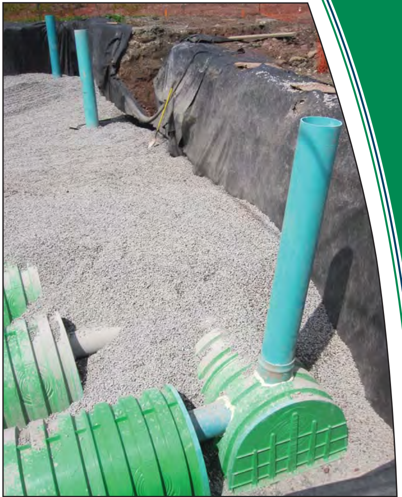
Inspection & maintenance ports above the main header row