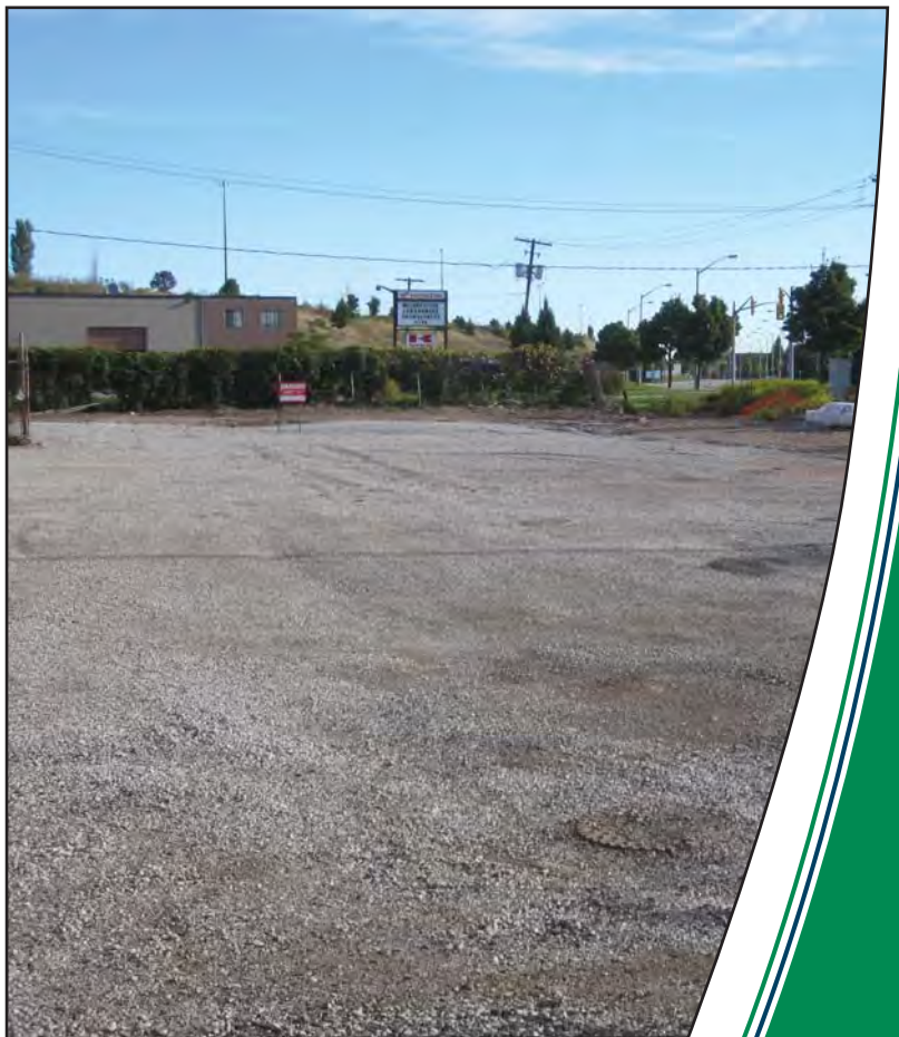
Gravel parking lot