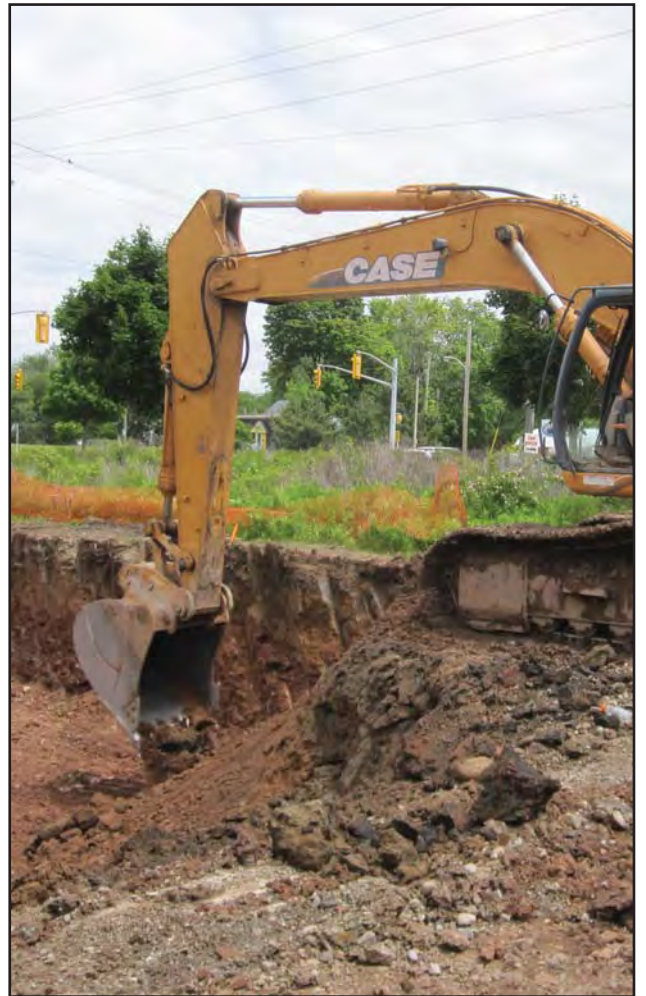
Excavation of trench, followed by lining the trench walls with non-woven geotextile and placing clear stone bedding at the bottom of the trench